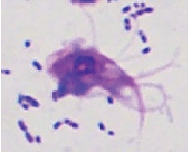
Figure 3: Pentatrichomonas hominis trophozoite, Giemsa, x1000

using 10 % dimethylsulphoxide (18). The isolated trichomonads were stained with Giemsa, trichrome and methylene blue stain. When examined by light microscopy, the Giemsa stain improved the visibility and enabled the enumeration of flagella (Figure 3).