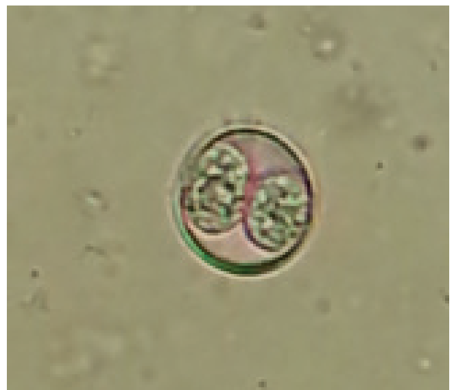
Figure 2: Isospora sp. oocyst, size 23 x 18 µm, flotation method, x400