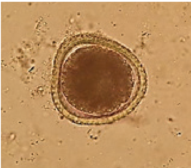
Figure 1: Toxocara canis egg, size 90 x 80 µm, flotation method, x400

Light microscopy of the native faecal smear and darkfield microscopy (wet mount examination) of the diarrhoeic material showed numerous motile trichomonad-like organisms with a particular circular motion. Flotation and the SAF method using light microscopy revealed Toxocara canis nematode eggs (Figure 1), Isospora sp. oocysts (Figure 2) and the above-mentioned trichomonad species. Bacteriological analyses of faecal samples were negative for aerobic and anaerobic pathogens. Trichomonad isolation and cultivation attempts were successful. Numerous motile trichomonads were observed after seven days incubation in MDM (xenic culture; with other organisms - bacteria - present). In MeMDM, the trichomonads were less abundant but other organisms were absent (axenic culture). The cultures were stored